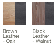
Brown Leather - Oak